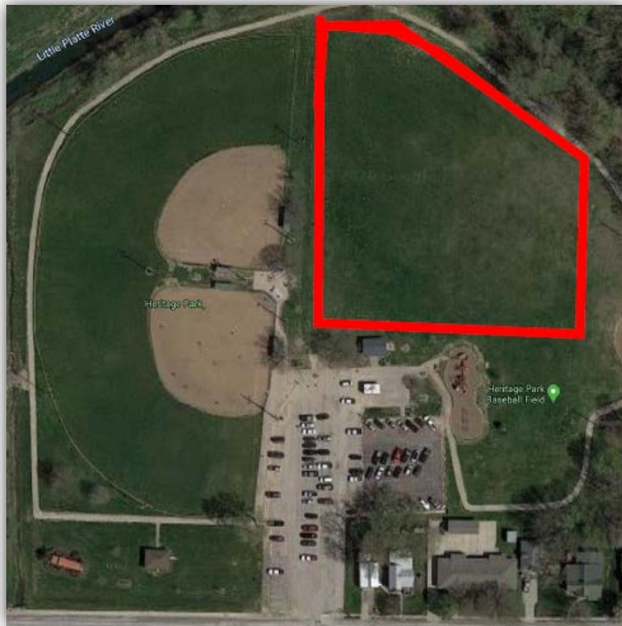
Heritage Park (Northeast Corner of the Park)